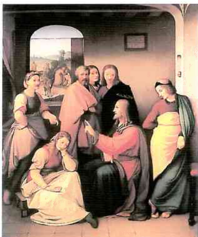
Christ in the House of Martha and Mary