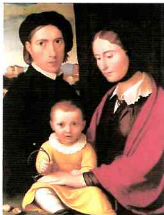
Self Portrait with Wife and Child

Born into a devout German Lutheran family, Johann Friedrich Overbeck (1789-1869) became the leader of a group of young German artists committed to Christian art and that in the style of the early Renaissance. They settled in Rome, where Overbeck became a Catholic in 1813. Known as the "Brotherhood of St. Luke" or as the "Nazarenes", they had a great influence on the popular Christian art of the 19 th century. They also inspired Britain's Pre-Raphaelite painters. Here are some of Overbeck's paintings.