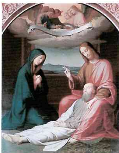
The Death of St. Joseph

Doubt isn't the opposite of faith; it is an element of faith. (Paul Tillich)