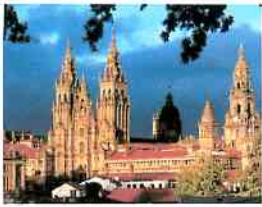
The Cathedral of Santiago de Compostela