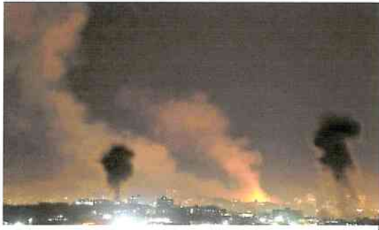
Gaza by night

“Cry out in the night-time, in the early hours of darkness; pour out your hearts like water before the Lord. Stretch out your hands to him for the lives of your children.”