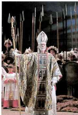
Verdi has him in one of his operas