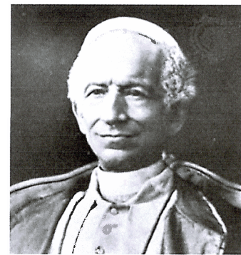
The Pope who first gave us the Church's social teaching. Restored the Scottish hierarchy. "The Pope of the Rosary". Died at the age of 93