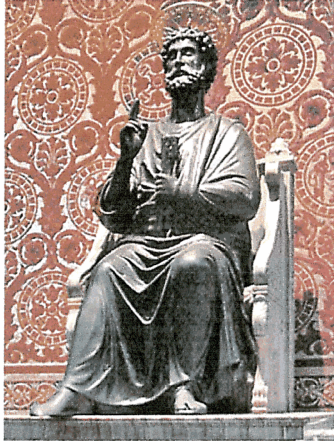
A statue of St. Peter in St. Peter's Basilica in Rome