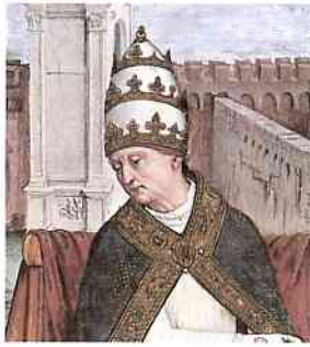
Walked through the snow on pilgrimage to Our Lady of Haddington