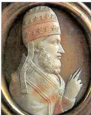
The only English Pope