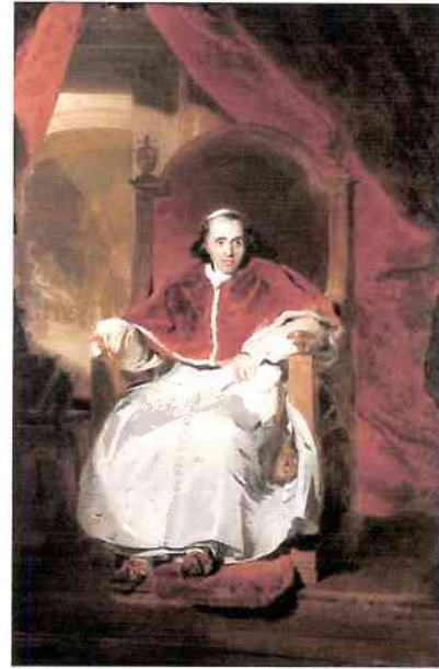
Why does his portrait hang in the Waterloo Room of Windsor Castle?