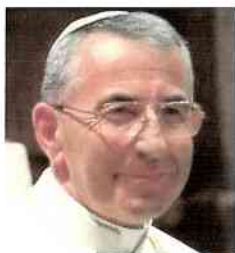
Did away with the Papal Coronation