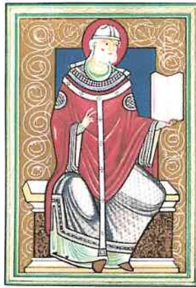
His name is given to plainchant