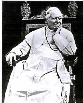
The last ruler of the Papal States