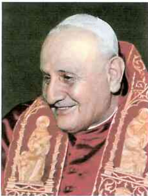
Opened the window to let the Spirit in