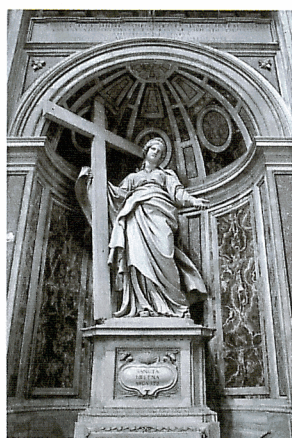
Statue of St. Helen in St. Peter's Basilica