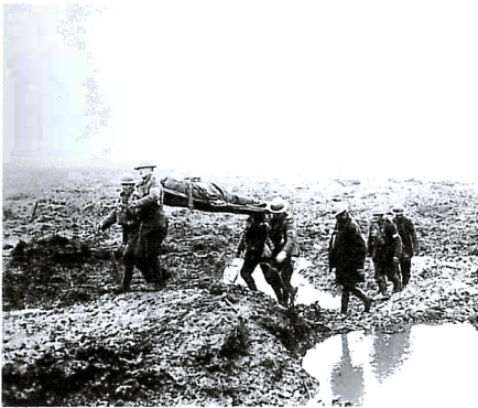
Carrying a soldier through the mud of Passchendaele.