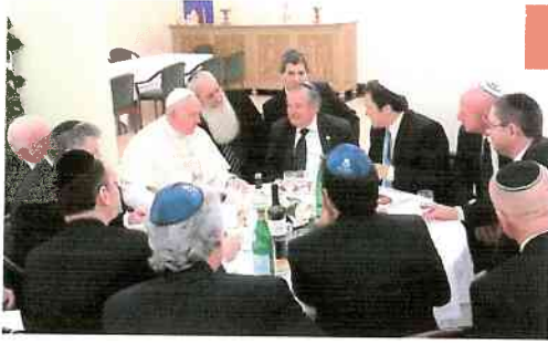
Pope Francis invites Argentinian Jewish leaders to a kosher lunch with him in his residence in the Vatican. January 2014.