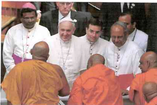
Pope Francis warmly greeted by Buddhist monks. Sri Lanka, January 2015