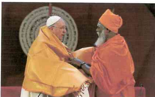
A Hindu religious leader places a cape on Pope Francis's shoulders. Sri Lanka, January 2015