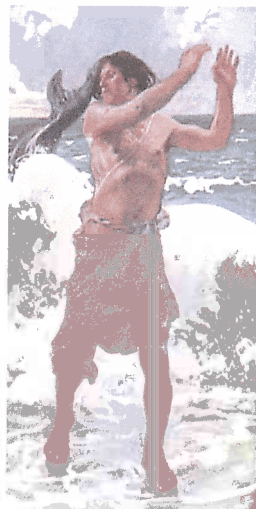
Jonah by James Tissot