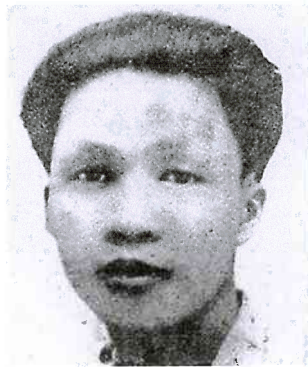
Hàn Mặc Tử