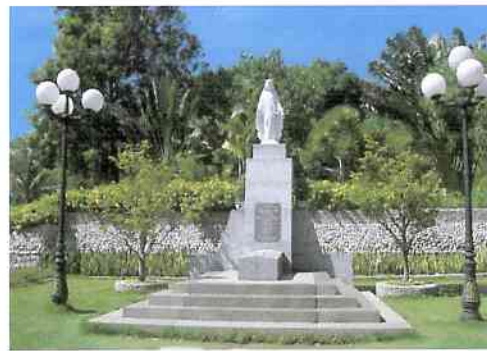
The tomb of Hàn Mặc Tử with its statue of Our Lady

There are still 500,000 persons afflicted with leprosy in Latin America, so it is still very much present. (Walter Salles, Brazilian film director)