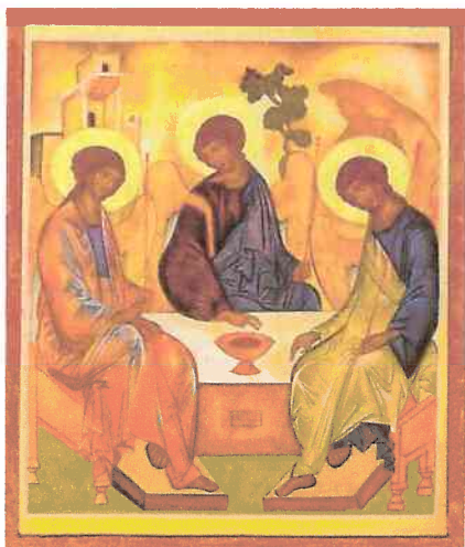
The Trinity Andrei Rublev (c.1360-1430)