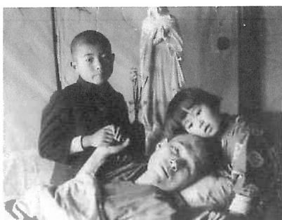
Takashi Nagai in the final weeks of his life, with two of his children.