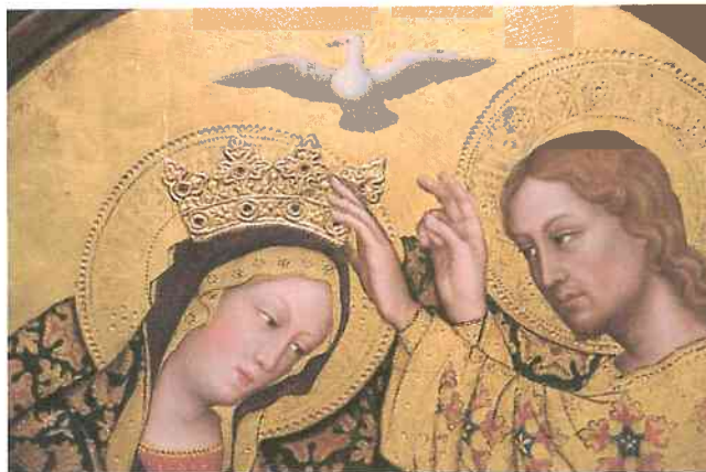
Detail of the Coronation of Our Lady by Gentile da Fabriano (c. 1370 – 1427)

Holy Communion will be taken to the housebound from Monday 24 th to Wednesday 26 th August.