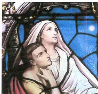
St. Monica and St. Augustine

The Assembly of the Priests of the Diocese will take place in Oban from Tuesday 1 st to Thursday 3 rd September.