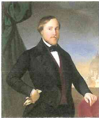
Prince Henri in his later years

Now that the Queen has become the longest reigning British, the shortest reign in the history of France comes to mind: it lasted twenty minutes! On 2 August 1830, Charles X abdicated, and twenty minutes later his elder son Louis Antoine also abdicated in favour of his nephew Prince Henri, barely ten years old. Charles X urged his cousin Louis Philippe of Orleans to proclaim Henri as Henri V of France. Louis Philippe ignored him. On the 9 August the French National Assembly decreed that the throne should pass to Louis Philippe. The young Henri then went into exile. It was while residing in Holyrood Palace that he visited Fort William. Moved by the poverty and the piety of those at Mass in the old Catholic Chapel, he commissioned a painting of Our Lady. It now hangs at the back of our church.