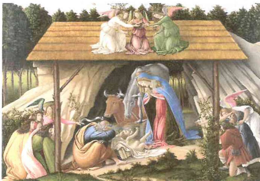
Detail from Sandro Botticelli’s “Mystical Nativity” Painted c. 1500-1501 The only work he ever signed