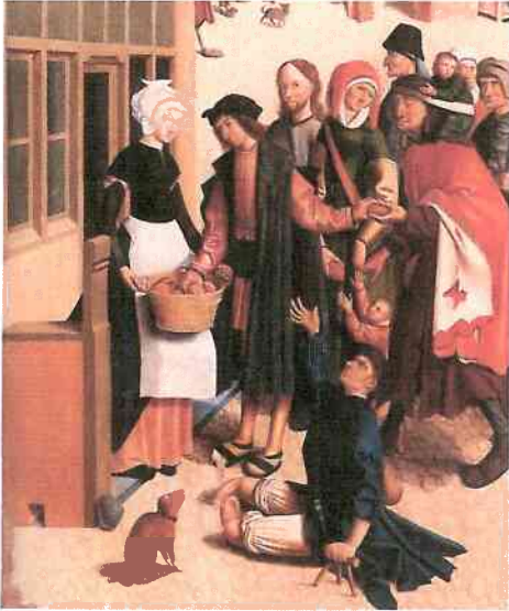
Feed the Hungry