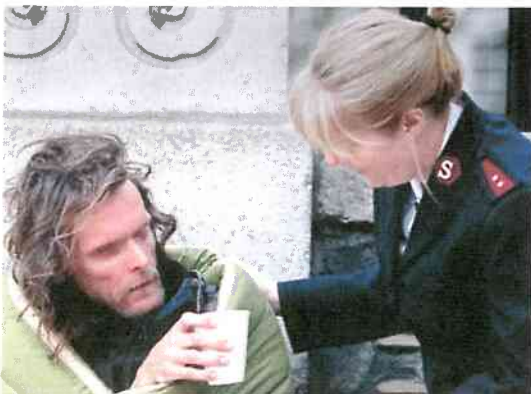
Give Shelter to the Homeless