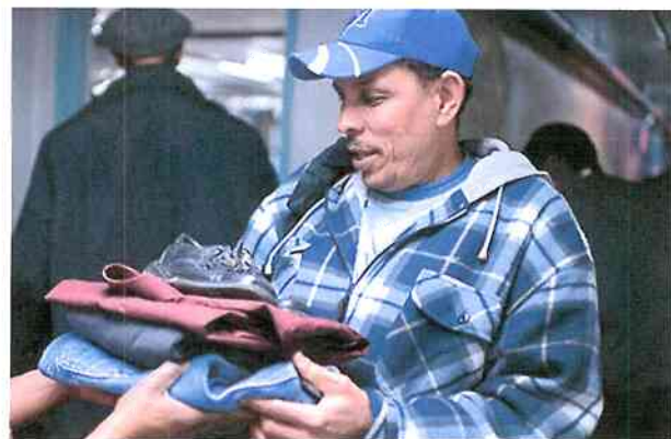
Clothe the Naked