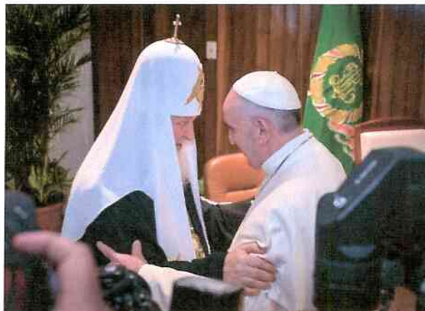
At last they meet! Pope Francis and Patriarch Kirill in Havana

Please note that the first of our Stations of the Cross will be on Wednesday at 7 p.m. Many blessings come from this devotion, so please do not lose contact with it.