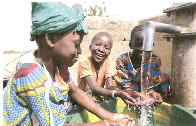
Give Water to the Thirsty

The paintings above are two of seven "Works of Mercy" depictions found in the Church of St. Lawrence in Alkmaar in the Netherlands. The artist is anonymous and is referred to as the "Master of Alkmaar". The paintings date from about 1504. The Church has two famous organs. The larger one is one of the oldest functioning organs in the world, containing 90% of the materials installed in 1723.