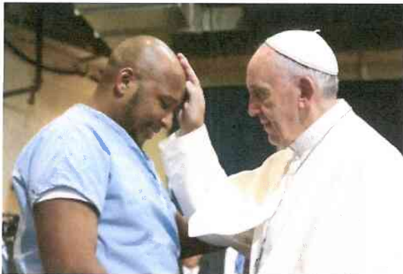
Visit the Imprisoned