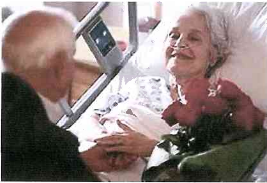
Visit the Sick