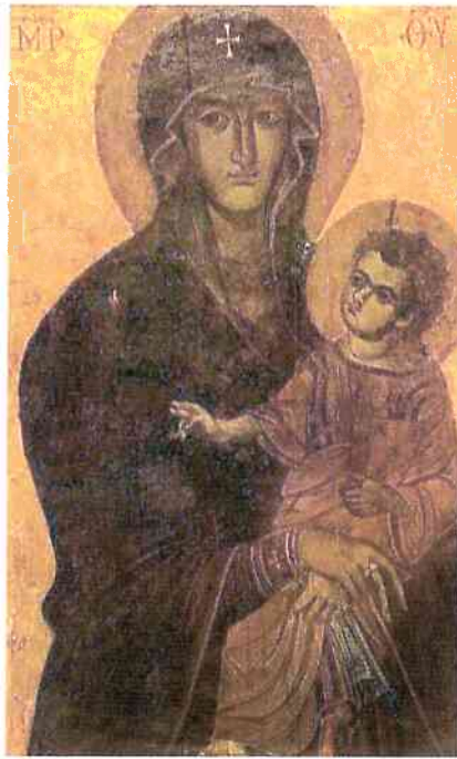
Protectress of the Roman People 5th century

Located in the Catacomb of Priscilla in Rome, Mary appears to be nursing the infant Jesus on her lap. It is dated to around A.D. 150.