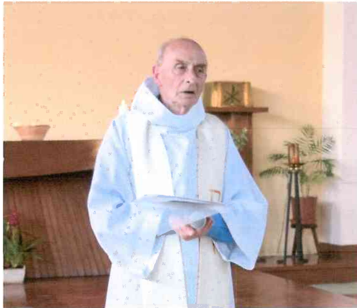
Père Jacques Hamel, martyred at the altar of God