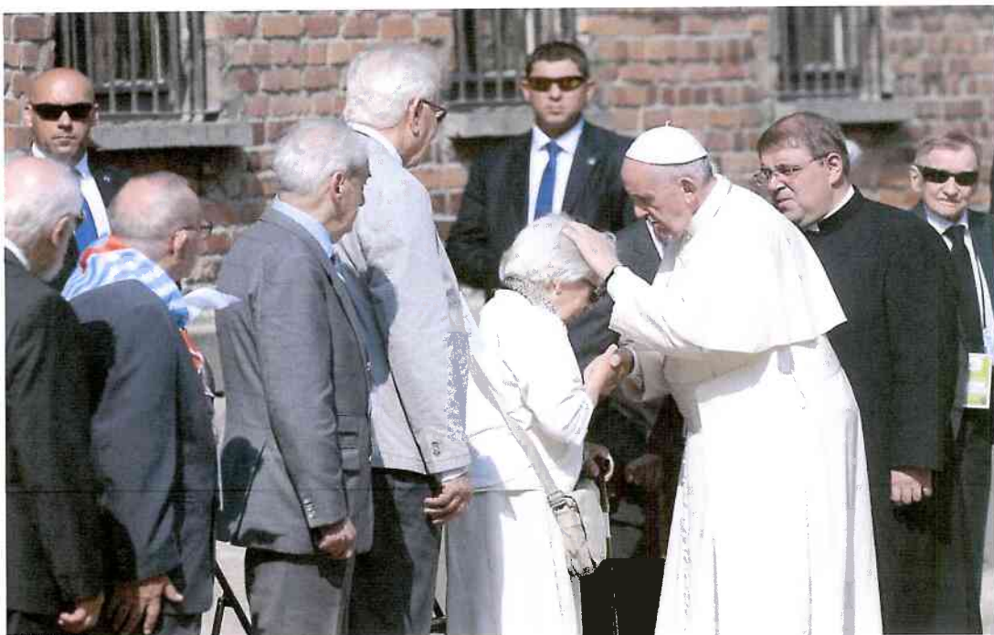
Pope Francis meets survivors of the Auschwitz-Birkenau Concentration Camp