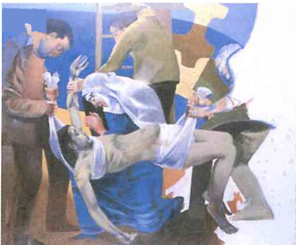
Arcabas : Pieta