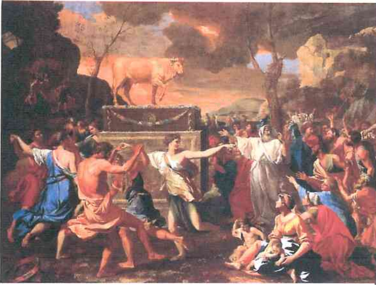
Poussin's "Worship of the Golden Calf"