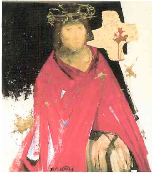
Arcabas: "Passion du Christ"