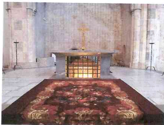
The tomb of Thomas Aquinas in the Dominican Jacobin Church, Toulouse, France

Ash Wednesday will be on the 1 st March; Easter Sunday on the 16 th April.