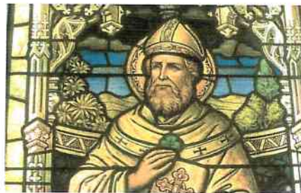
Saint Patrick, pray for us

The Lenten SCIAF collection will be on the 26 th March. We know that you will be as generous as ever!