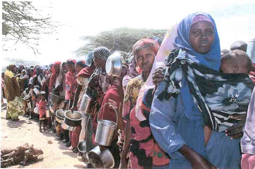
Mothers' Day in East Africa

The forgotten world is made up primarily of the developing nations, where most of the people, comprising more than fifty percent of the total world population, live in poverty, with hunger as a constant companion and fear of famine a continual menace. Norman Borlaug