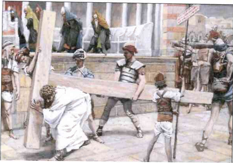
Christ carries the Cross by James Tissot