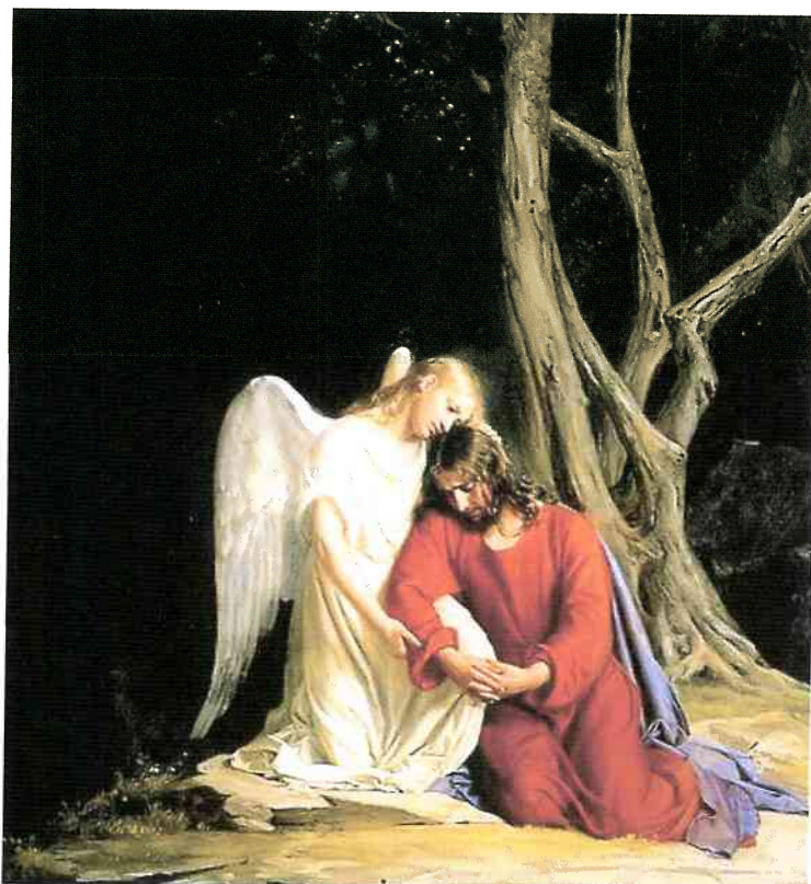
Gethsemane by Carl Bloch