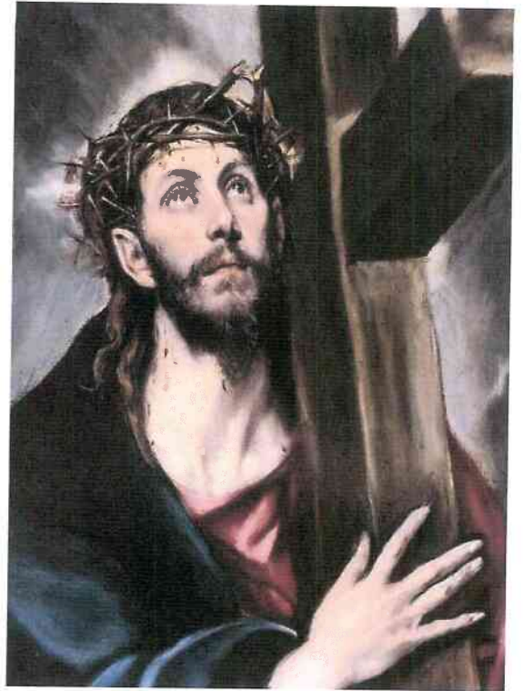
Christ carries the Cross by El Greco