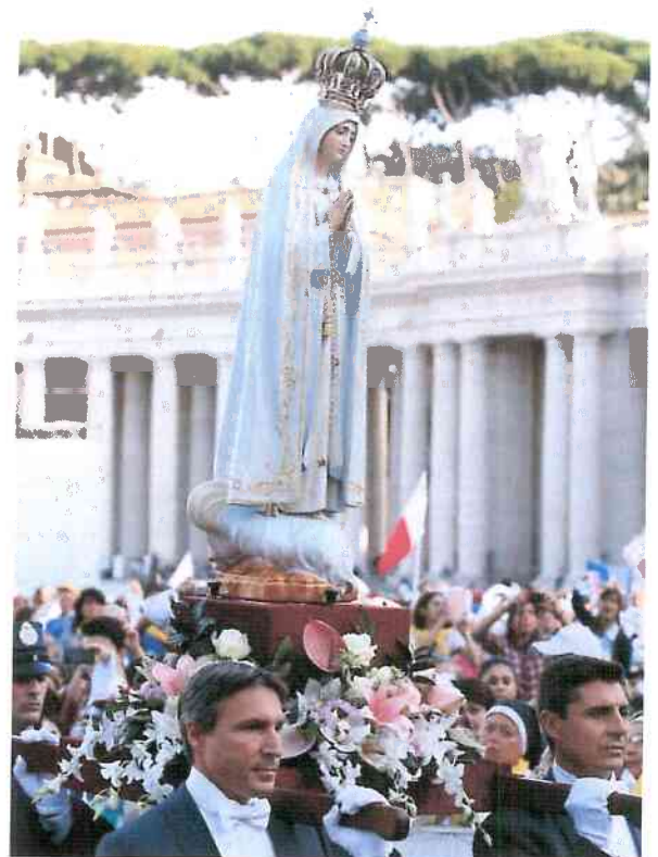
An image of Our Lady of Fatima is carried in procession

Here we see the three little children of Fatima: nine-year-old Lúcia Santos and her cousins Jacinta and Francisco Marto. Like Bernadette in Lourdes, they were subjected to the threats of the local authorities, but they would not recant in what they had seen and experienced. They reported seeing "a woman brighter than the sun, shedding rays of light, clearer and stronger than a crystal goblet filled with the most sparkling water and pierced with the most burning rays of the sun." The woman wore a white mantle edged with gold and held a rosary in her hand. She asked the children to devote themselves to the Holy Trinity and to pray the Rosary every day, to bring peace to the world and an end to war.