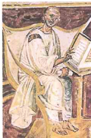
The earliest known portrait of Saint Augustine in a 6th-century fresco, in the Lateran Basilica in Rome

“I asked the whole frame of the world about my God; and he answered,” I am not He, but He made me.”” “Do you wish to rise? Begin by descending. You plan a tower that will pierce the clouds? Lay first the foundation of humility.” “Love is the beauty of the soul.” “No eulogy is due to him who simply does his duty and nothing more.” “He that is kind is free, though he is a slave; he that is evil is a slave, though he be a king.”