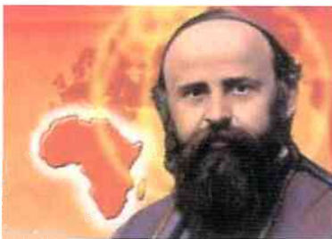
St. Daniel Comboni