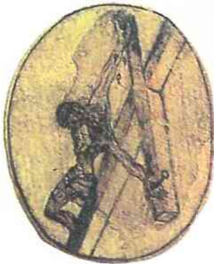
The sketch made by St. John of the Cross

A new reproduction of Salvador Dalí's "Christ of St. John of the Cross" now hangs in the church porch. Why is it so called? Its inspiration comes from the Carmelite friar, poet and mystic, St John of the Cross. (1542-1591) He was praying, looking down on the sanctuary of the Convent of the Incarnation in Avila. Suddenly, he has a vision of the crucified Lord below him. Later, he did a sketch of what he had beheld. It is still preserved in the Convent of the Incarnation.