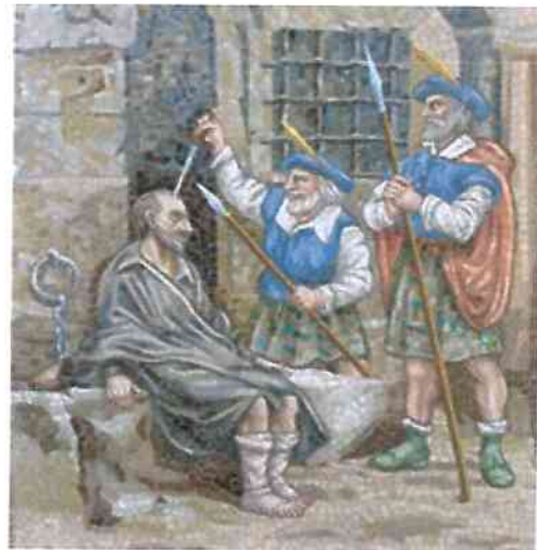
Mosaic from the National Shrine of St John Ogilvie (1933) in the Jesuit Church of St Aloysius, Glasgow.

'The Watching' was the torture of sleep deprivation practised on John Ogilvie for nine consecutive nights in 1615. Sharp pins and knives were used to keep him constantly awake as shown in this mosaic.