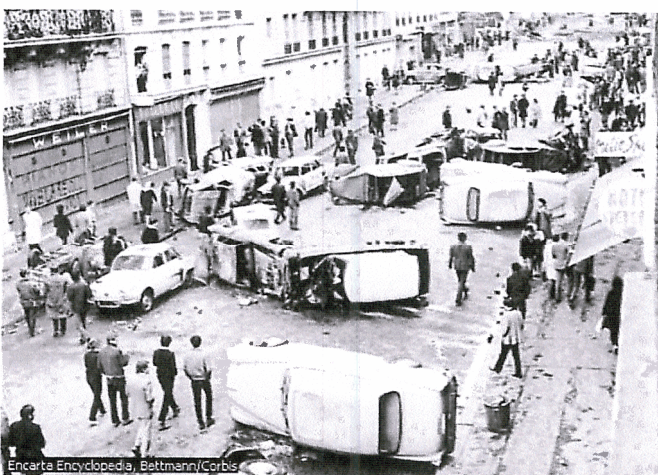
A street in Paris, May 1968, after a night of rioting

See, the Conqueror mounts in triumph, See the King in royal state, Riding on the clouds His chariot To His heavenly palace-gate; Hark, the choirs of angel voices Joyful halleluiahs sing, And the portals high are lifted, To receive their heavenly King. ( William Wordsworth )