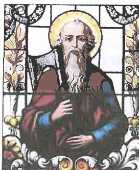
Image of St. Matthias with the instrument of his martyrdom

After Mass next Sunday morning, there is a rehearsal for our First Communicants . Please ensure that the children be there, so that they learn receive the host in a proper and dignified way.