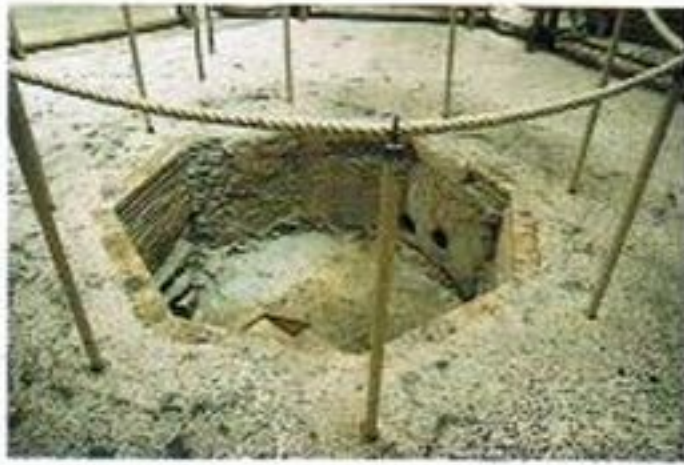
Ancient Baptismal Pool in Aix-en-Provence, France