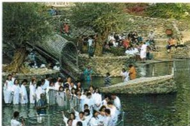
Waiting to be baptised in the River Jordan