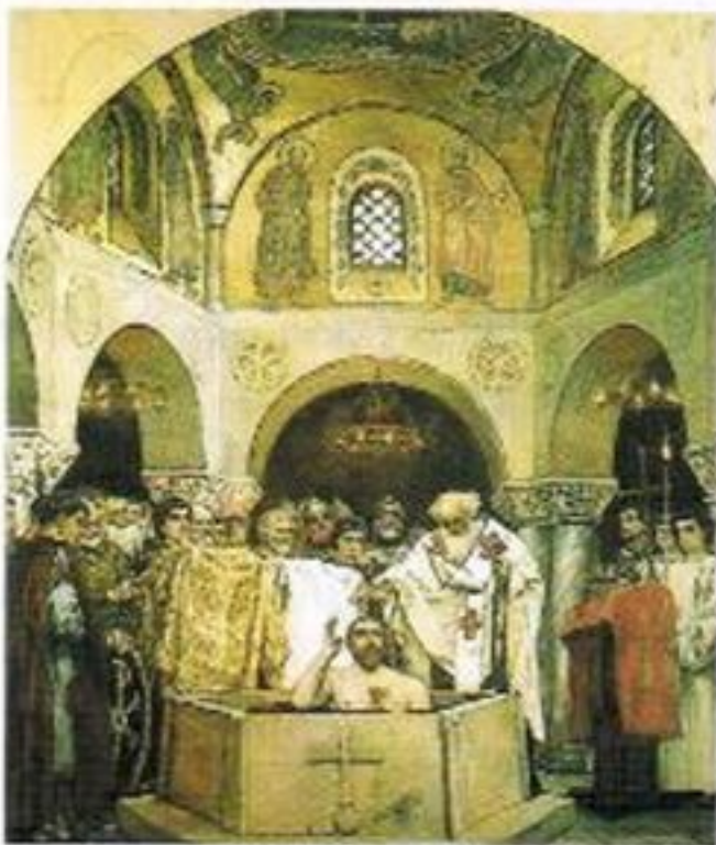
The Baptism of King Vladimir in Kiev

The two photographs above are evidence of the immersion form of baptism used in early churches. The catechumen entered the pool for baptism and emerged to receive the white baptismal robe of one who has died to sin and now rises to a new life in Christ. St. Augustine was most likely baptised in the pool in Milan Cathedral. The picture of the baptism of King Vladimir in Kiev shows a variation of this form of baptism by immersion. The white robe awaits him, replacing the golden royal tunic. Those queuing for baptism in the River Jordan will shortly undergo baptism by submersion , being plunged right under the water. There are two other ways of baptising: " aspersion ", the sprinkling of water on the head, and " affusion ", the pouring of water on the head. The latter is the form that is the custom in St. Mary's.