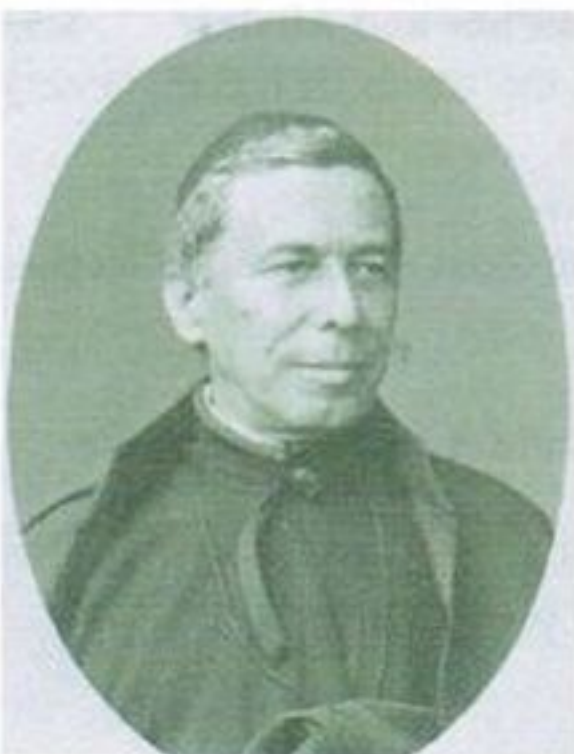
Fr. Angelo Secchi S.J.

Of all those in charge of the Observatory, the most famous was Father Angelo Secchi (1818-1878). He made contributions to many areas of astronomy. He invented the heliospectograph, for example. Through the use of prism he was able to analyse the spectra of the different stars. This helped determine the temperature and chemical make-up of a star, and much more. Fr. Secchi had a special interest in the Sun. He observed and made drawings of solar eruptions and sunspots. This area of study remains very important in our own time, as people become more and more aware of the effect of such things on our planet. How would a major flare from the sun affect our communications, so dependent on satellites, for example?