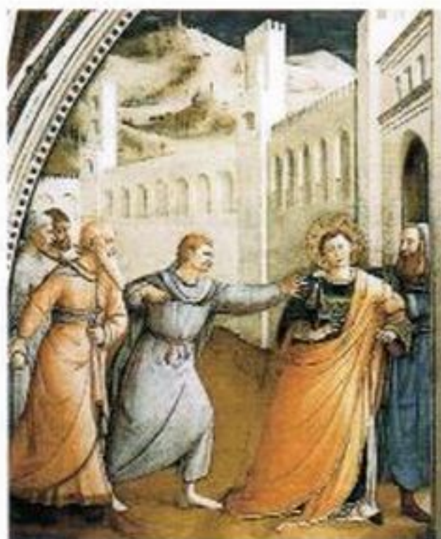
The Arrest of St. Stephen Fra Angelico