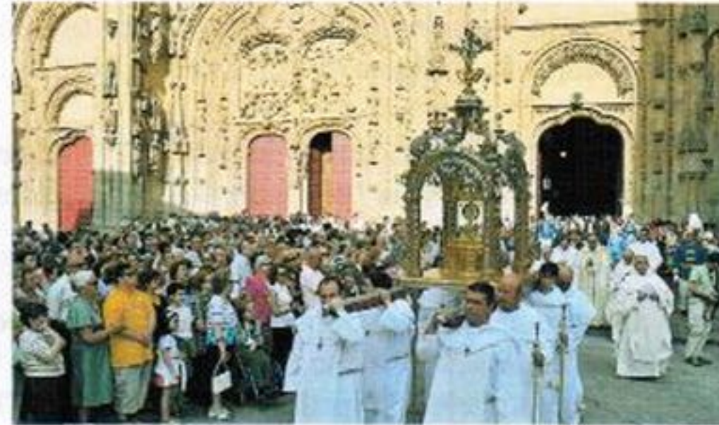
Santiago de Compostela Spain