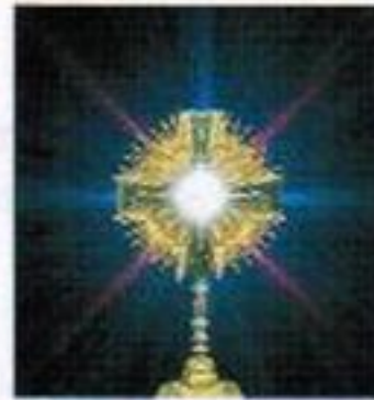
Adoro te devote latens Deitas. (Thomas Aquinas)