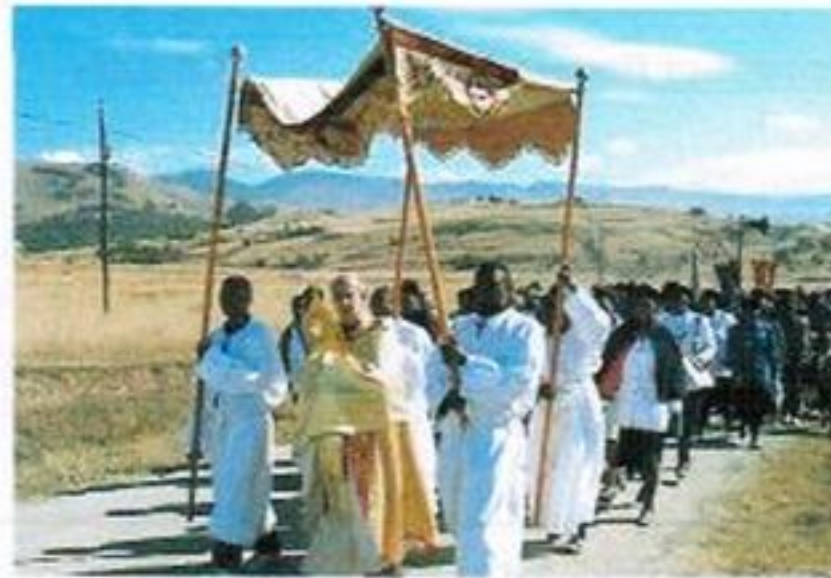
Zulu-Natal South Africa