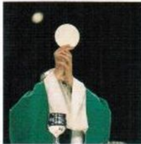
The Elevation Notre Dame de Paris