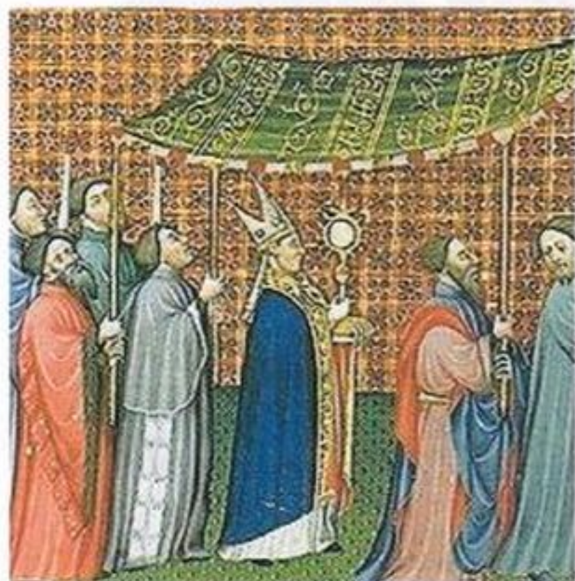
A Medieval Corpus Christi Procession