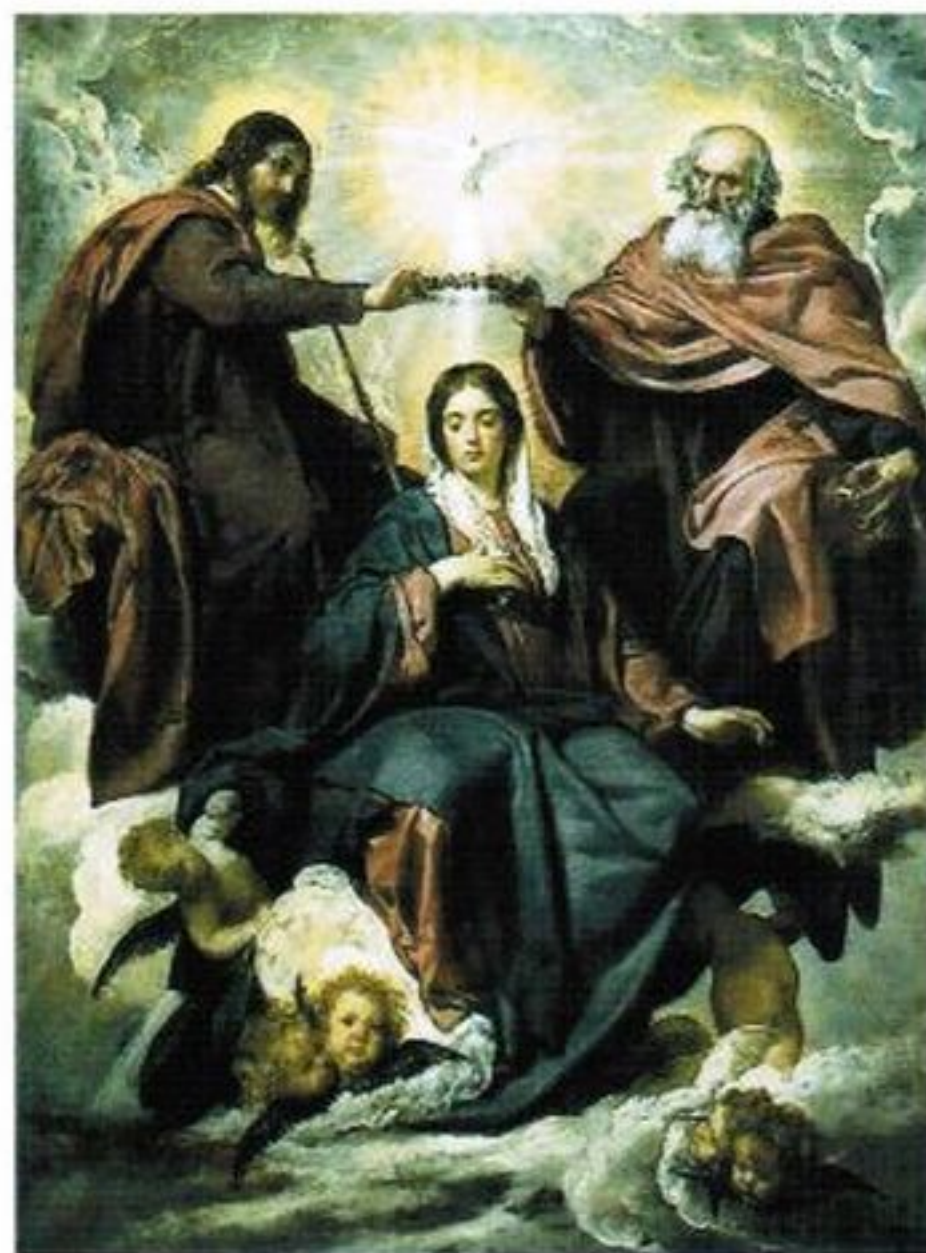
The Coronation of Mary by Velázquez