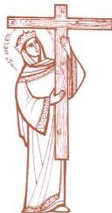
St. Helen and the Holy Cross