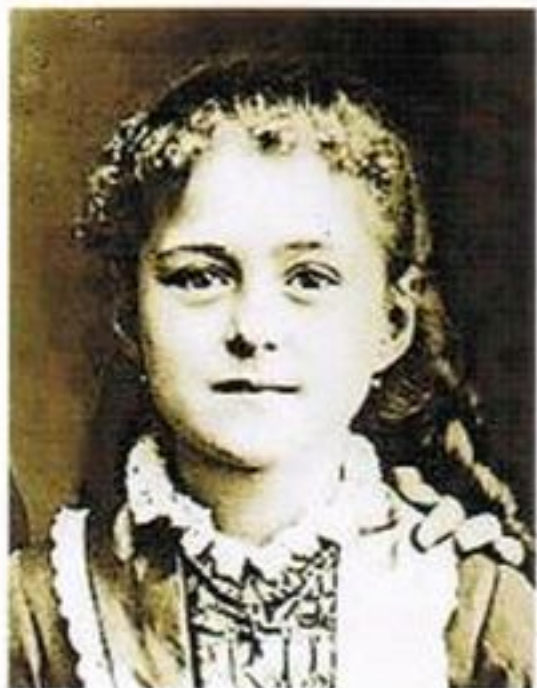
The young St. Thérèse

The innocent victims of Nairobi and Pakistan are obviously in our thoughts and prayers. When will the hate-filled men and women of violence stop perverting religion?