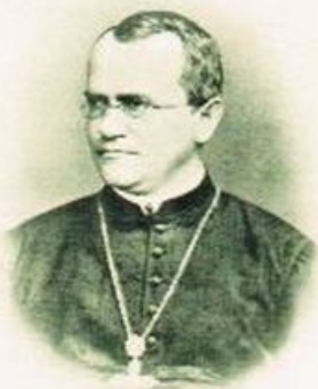
Gregor Johann Mendel