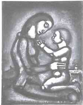
“Bella matribus detestata” (Wars, hated by mothers) Georges Rouault