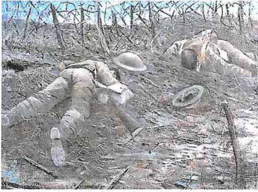
“Paths of Glory” C.R.W. Nevinson