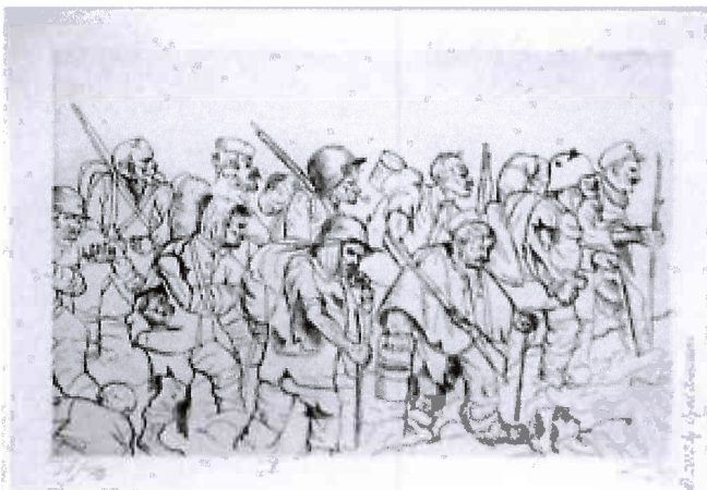
Weary German soldiers retreating at the Somme Otto Dix

For nation will fight against nation, and kingdom against kingdom. There will be famine and earthquakes here and there. All this is only the beginning of the birthpangs. (Matthew 24:7-8)